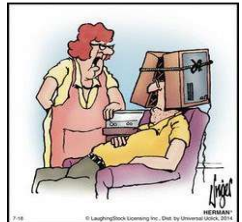
"Why don't you buy a proper set of headphones?"