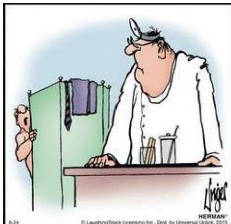
"Okay, I'm coming out now. Close your eyes!"