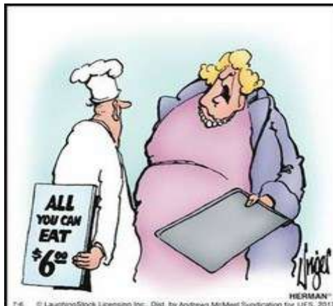
"What are you hiding behind your back?"