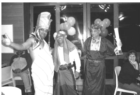
...Fancy dress parade

Sunday 11th June We started cooking Pol-roti and steaming kiribath and pancakes for the children. We were ready with food to go in to the bain-marie, when low and behold some one had poured water into the troughs containing the heaters. We had to drain all the water out before we could put in the accompanying curries for a good feast. Next off they went to play Tennis and cricket. Persis and I revived our courting days experience by heading to Crows Nest and losing our way, after 40 odd years it was a refresher course in romance. After lunch we planned for the talent contest and later had a rest.