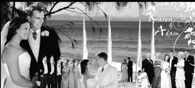
▲ CANVAS MONTAGE Printed on high quality canvas and stretched onto wooden frame, ready for hanging!

We can use your photos to create a montage! Either frame it on your wall, or print it on a canvas!