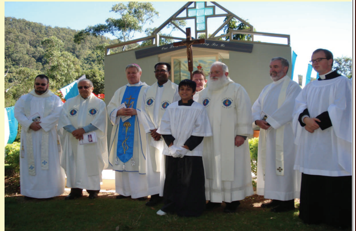
Madhu Feast celebrations 2009