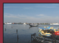
North India & Kerala 16-Day Tour