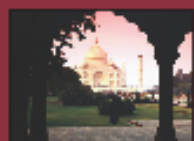
Royal Rajasthan 15-Day Tour

Check out our website for exclusive deals to Sri Lanka and India.