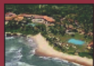
Sri Lanka 21-Day Tour

Our new website updated weekly with the latest specials.