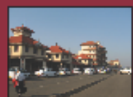
South India 7 & 14-Day Tours