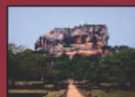
Sri Lanka 15-Day Tour