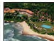
Sri Lanka 21-Day Tour

Our new website updated weekly with the latest specials.