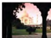
Royal Rajasthan 15-Day Tour

Check out our website for exclusive deals to Sri Lanka and India.