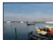
North India & Kerala 16-Day Tour