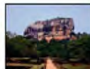
Sri Lanka 15-Day Tour