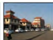
South India 7 & 14-Day Tours