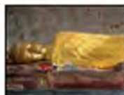
India & Nepal 12-Day Tour