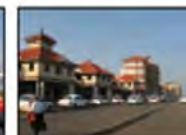
South India 7 & 14-Day Tours