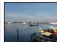
North India & Kerala 16-Day Tour