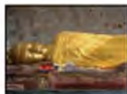
India & Nepal 12-Day Tour