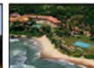
Sri Lanka 21-Day Tour

Our new website updated weekly with the latest specials.