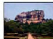
Sri Lanka 15-Day Tour