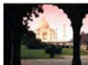
Royal Rajasthan 15-Day Tour

Check out our website for exclusive deals to Sri Lanka and India.