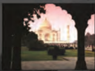
Royal Rajasthan 15-Day Tour

Contact us on (07) 3808 2299 for details of our exciting tour packages.