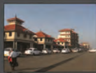
South India 7 & 14-Day Tours