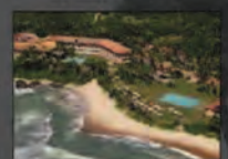
Sri Lanka 21-Day Tour