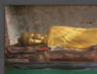
India & Nepal 12-Day Tour