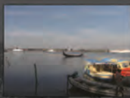
North India & Kerala 16-Day Tour