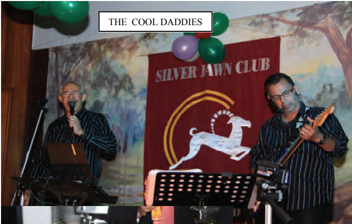
THE COOL DADDIES