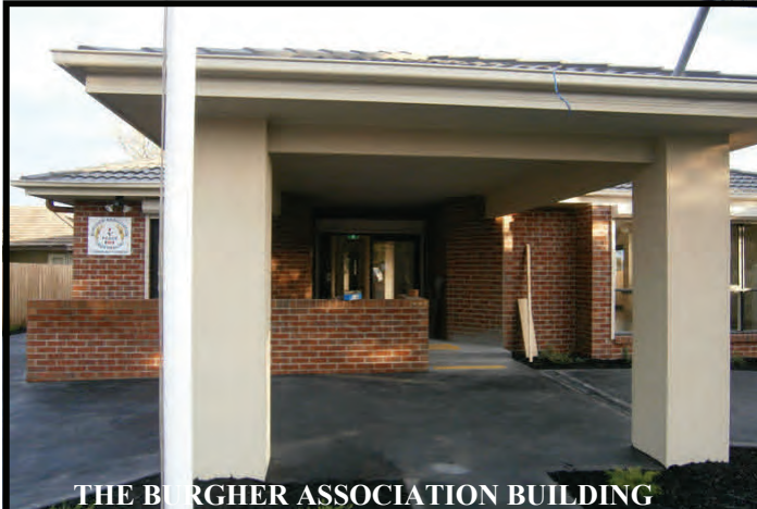
THE BURGER ASSOCIATION BUILDING