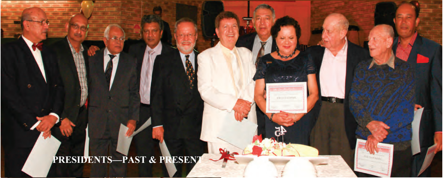
PRESIDENTS—PAST & PRESENT